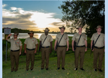
West Arnhem communities hold ANZAC Day commemorations on 25 April 2026.