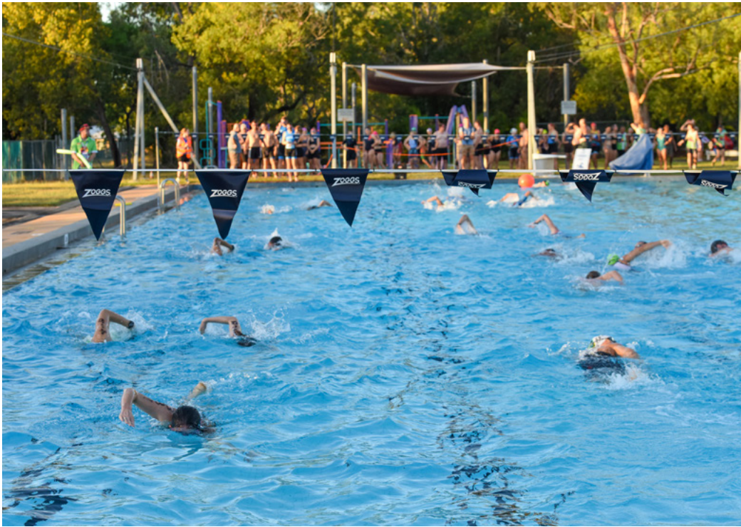
The 2026 Kakadu Triathlon was held at the Jabiru Swimming Pool on Saturday, 2 May, hosted by West Arnhem Regional Council.