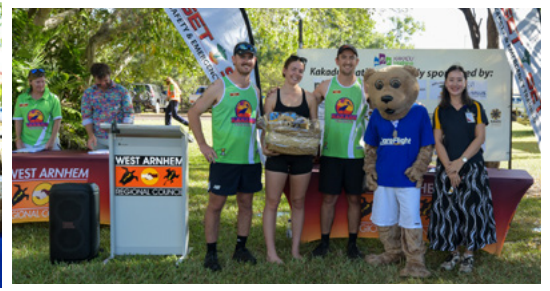
The Tripods 2.0 won both the Triathlon Team event and the highest fundraising team.