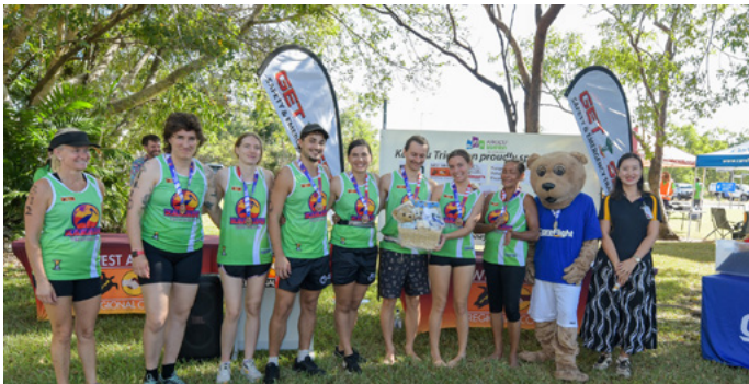
Congratulations to the Coinda Lodge team for being one of the highest fundraising teams for CareFlight.