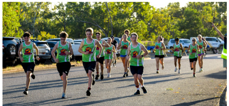
The busy start line of the open 5km Kakadu Challenge Race.