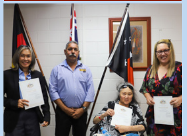
Three West Arnhem residents proudly became Australian citizens in Jabiru.