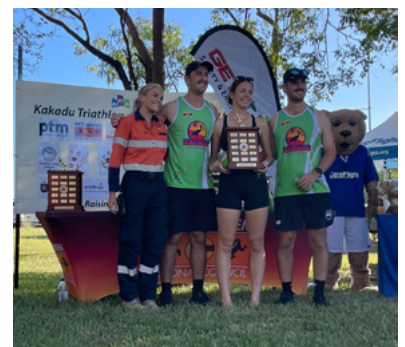
Congratulations to Tripods 2.0 for taking the win of the Team event once again!