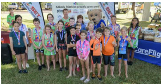
There were around 40 junior participants joining in the fun on the morning. Well done to all of our juniors!