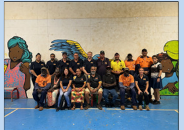
The next round of WARC Local Authority meetings will be held next week in all communities.