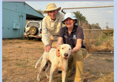
The 2026 West Arnhem Animal Management Program has resumed.