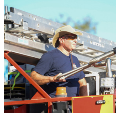
The Jabiru Fire Station hosing everyone down at the finish line.