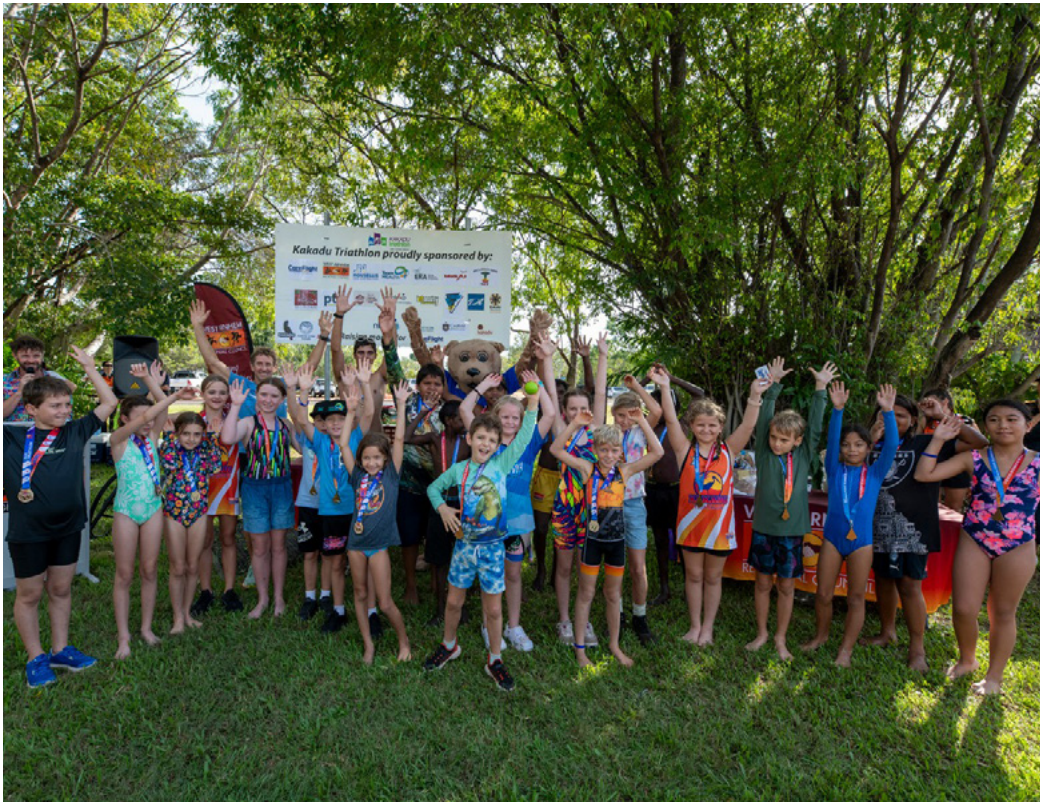
The Kakadu Triathlon offers a fun and supportive event set against the unique backdrop of Jabiru and Kakadu National Park.