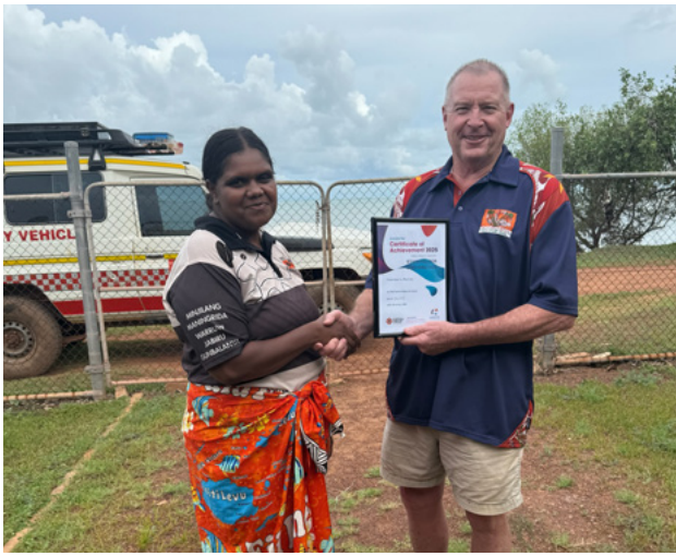
Winner of the 2025 Stakeholder of the Year Award, Red Lily Health in Warruwi.