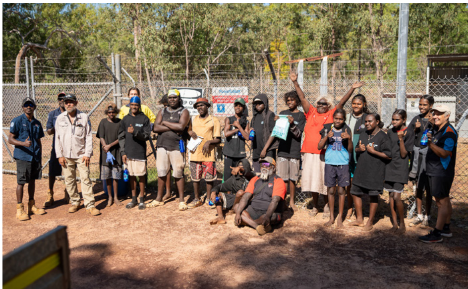
That's a wrap! Group photo from day 2 Waruwi Water Festival.

Power and Water works with communities like Waruwi to share with people how precious water is, where it comes from and how they can help protect it.