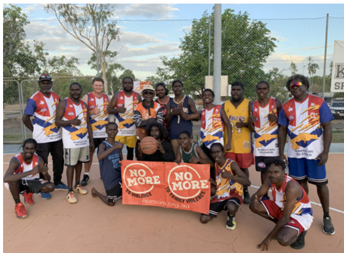
The Warruwi Storm men's basketball team taking to the court on Friday night.