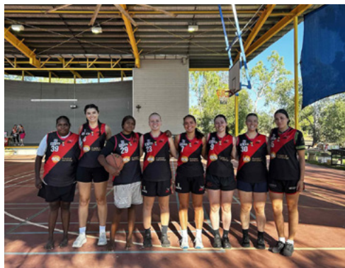
Jabiru Bombers women's basketball team in uniform before the competition commenced.