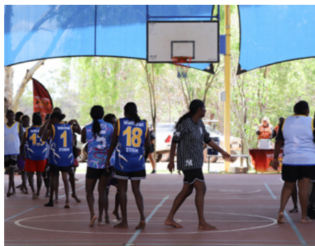
The Warruwi Storm women's basketball team shaking hands at the end of their game.