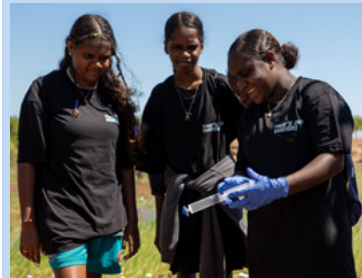
Power and Water team host Warruwi Water Festival.