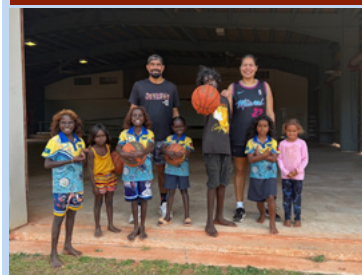
Minjilang hosts activity program in collaboration with the Jamie-Lee Paris Basketball Organisation.