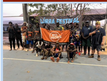
This year's Lúrra Festival in Maningrida was nothing short of spectacular.