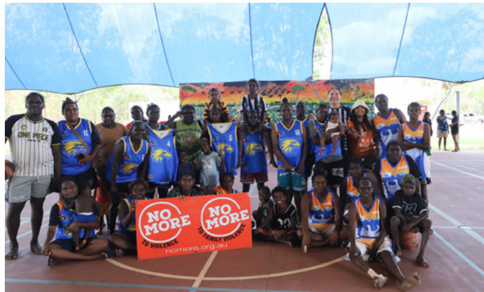
The Minjilang Eagles and Maningrida women's basketball teams come together in unity after Minjilang took the win in the grand final.