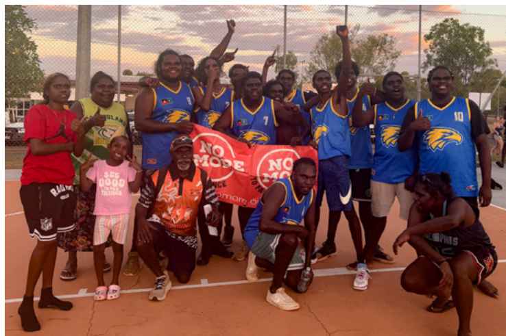
The Minjilang Eagles men's basketball team coming together during the competition.