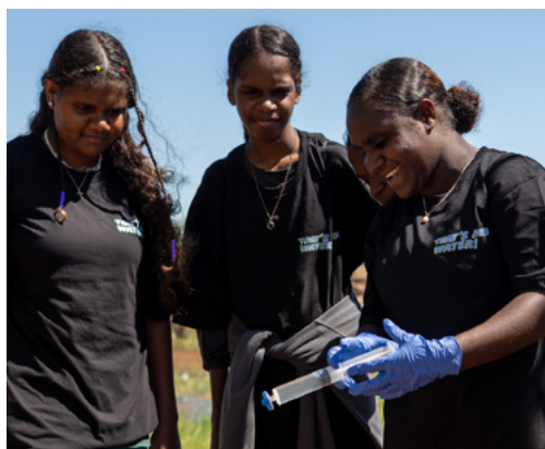
Waruwi Junior Rangers testing billabong water for eDNA.