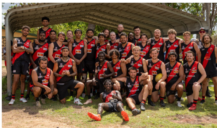
The Jabiru Bombers men's AFL team preparing for the competition on home soil.