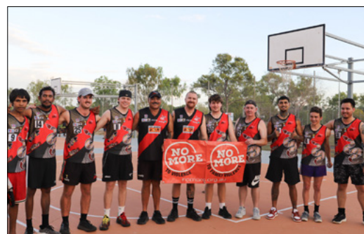
The Jabiru Bombers men's basketball team in their new team uniforms before the competition got underway on Friday night.