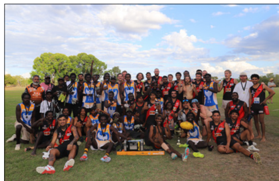
The Maningrida and Jabiru Bombers men's AFL teams come together as Runners Up and Winners.