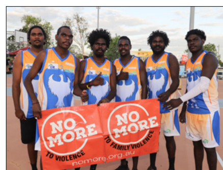
The Maningrida men's basketball team getting ready to take to the court on the Friday night.