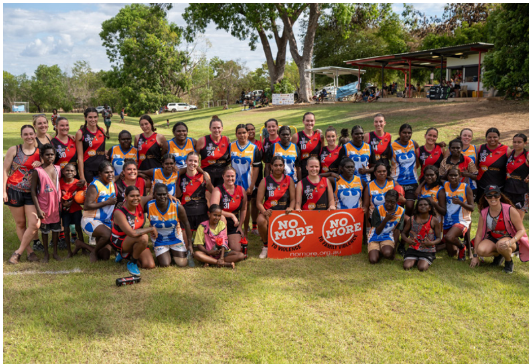
The 2025 Kurrung Sports Carnival program included a women's AFL showcase match with Maningrida versus Jabiru Bombers. Both teams displayed amazing sportsmanship and skill.