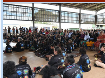
Gunbalanya School reaches a milestone, celebrating a Century of two-way education.