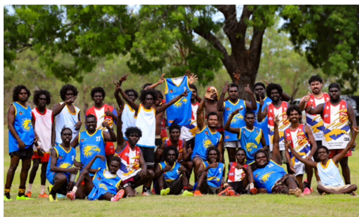
Minjilang and Waruwi men's AFL teams showing great sportsmanship after their final game.