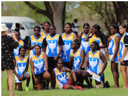
The Maningrida women's AFL team preparing for their showcase game against the Jabiru Bombers.