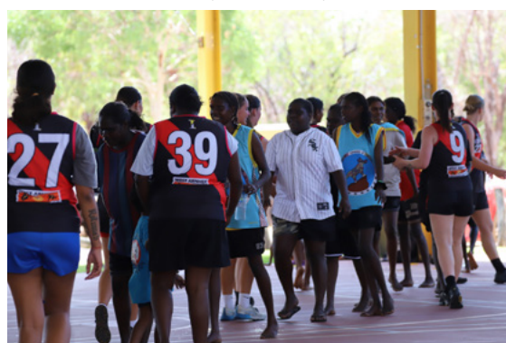
Jabiru Bombers and Gunbalanya women's basketball teams showcasing strong sportsmanship.