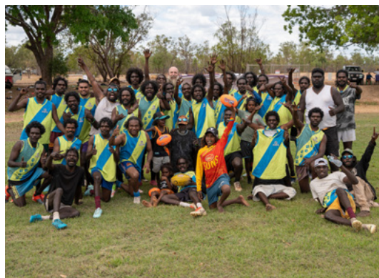
The Gunbalanya men's AFL team getting ready for their first game at the start of the carnival.