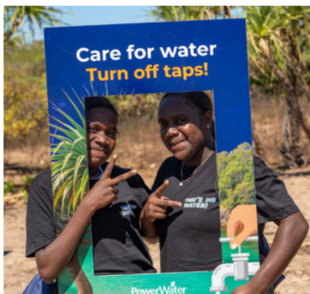
Waruwi Junior Rangers strike a pose to promote efficient use of water by turning off taps when not in use.