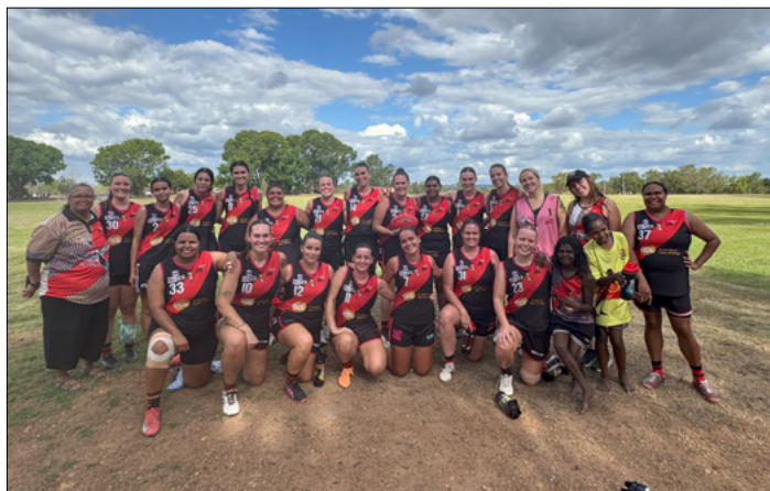
The Jabiru Bombers women's AFL team celebrating their win of the Kurrung showcase match against Maningrida.

Men's Basketball – The Jabiru Bombers and Minjilang Eagles battled it out under the court lights. With the crowd cheering on both sides, Minjilang finished strong in the second half, taking the win 11–6.