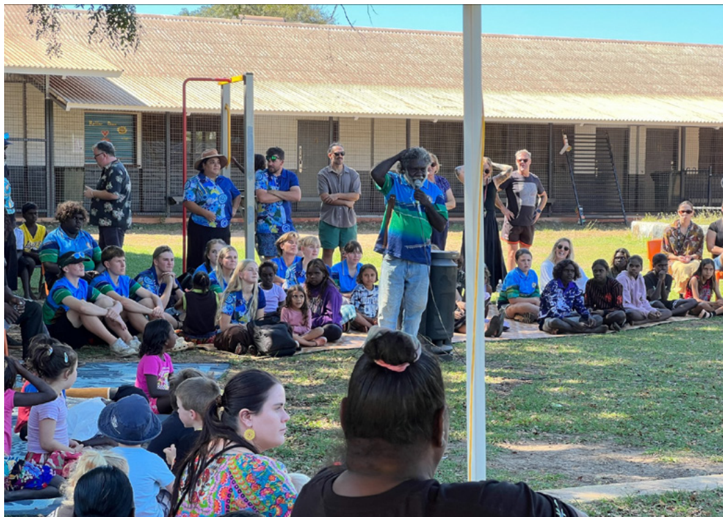
The very first Maningrida and Homelands Youth Summit has been a powerful gathering of young people from 12-15 August 2025.