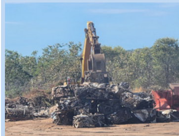
Gunbalanya's landfill is looking clearer thanks to a major clean-up effort by Sell and Parker.