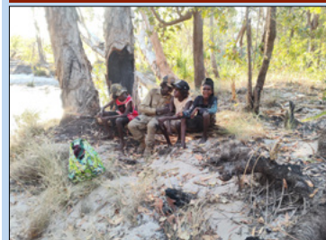
Gunbalanya YSR team up with TeamHealth for a special cultural experience in Kabulwarnamyo.