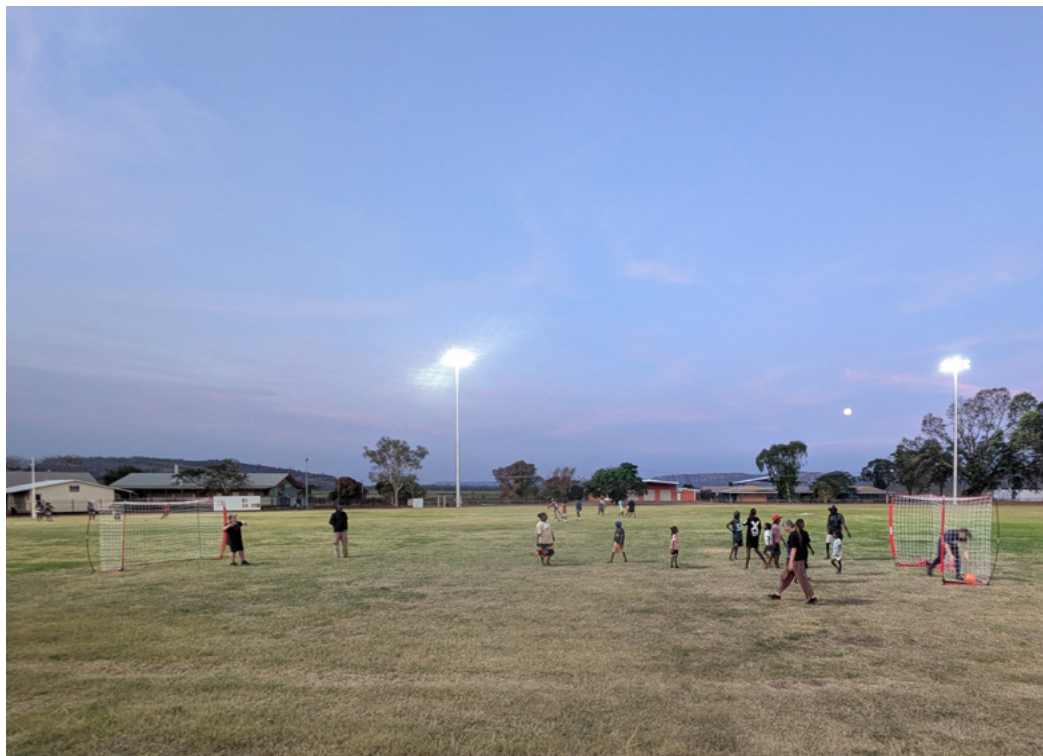
Gunbalanya held a great NAIDOC Week celebration with a big community day and plenty of activities for all ages. Read more, Page 7.