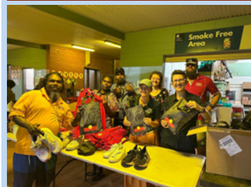
Celebrating history, culture, and achievements of Aboriginal and Torres Strait Islander peoples.