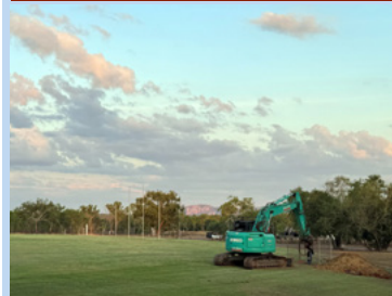
Exciting upgrades are happening at Brockman Oval in Jabiru.