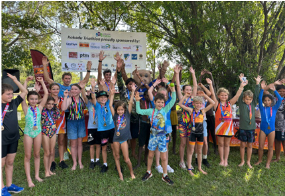
There were 39 enthusiastic junior participants at this years event.