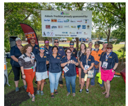
West Arnhem Regional Council staff behind the 2025 Kakadu Triathlon.