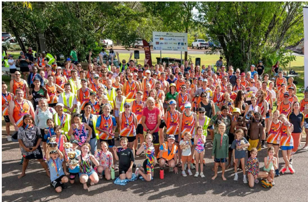
The spirited community of Jabiru came alive with energy and excitement on Saturday, 10 May, for the 2025 Kakadu Triathlon.