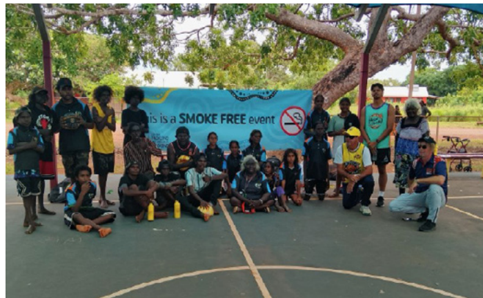
West Arnhem Regional Council in Waruwi partnered with Red Lily Health, Waruwi Community School and Yagbani Aboriginal Corporation to deliver the First Nations-led strength-based program.