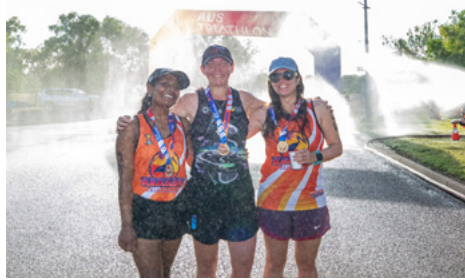
The happy 5km Kakadu Challenge participants at the finish line.