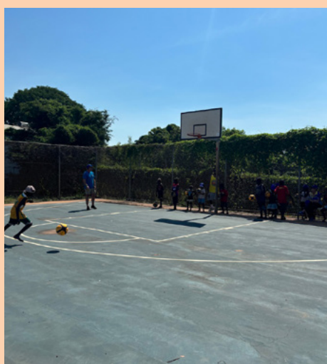
Minjilang hosted Red Lily Health and Hoop 4 Health last week, supported by West Arnhem Regional Council and Mamaruni School.

A big thank you to the local community members who helped bring even more participants to be part of the program."