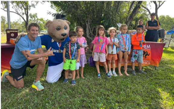
The youngest junior participants at this year's event with the Careflight bear.