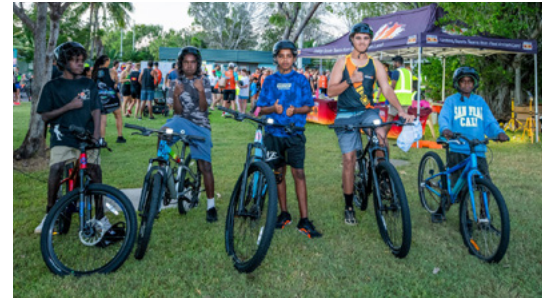
The young Junior Tri participants from Gunbalanya with the new bikes donated from Blue Cycles.