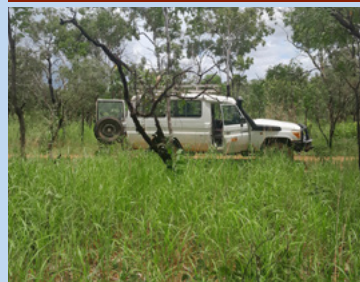
Kakadu Community Care clients enjoying on country activities.