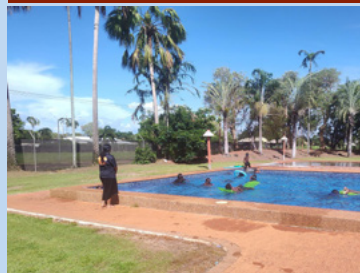
West Arnhem Regional Council and SCFC join forces to make use of the Gunbalanya Pool.