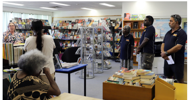
West Arnhem Regional Council Elected Members visiting the Jabiru Library this week.