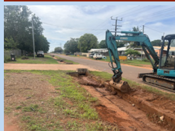
The Council team has been cleaning up New Sub and Bottom Camp in Maningrida recently.