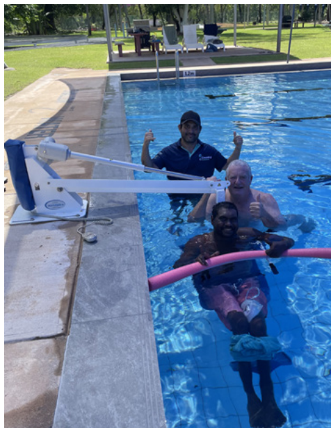
Visit to Jabiru Town Pool by Country Connect staff with client who were then assisted by WARC Staff to fully enjoy the facility.