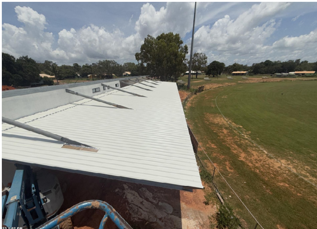
The excitement surrounding the construction of the new Maningrida change rooms continues with the roof sheeting works now under way.