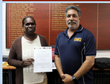
West Arnhem Regional Council swears in new Elected Member for the Gunbalanya Ward.