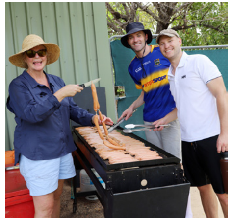
Caulfield Grammar assisting at the Jabiru Community Day.

Thank you to Caulfield Grammar, Marrawuddi Gallery, ALPA, Kakadu National Park, Red Lily Health and Kakadu Supermarket.