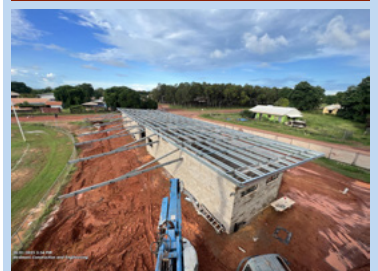
Council is thrilled to announce significant progress on the new Maningrida Changerooms.