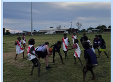
Gunbalanya had a visit from AFL NT to assist with Gunbalanya Day 2025.