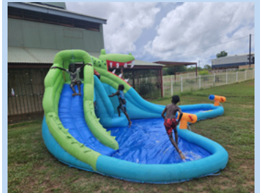
Minjilang celebrates Australia Day with a barbecue, water activities and a colouring competition.