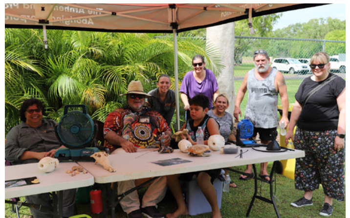
Kakadu National Park held a crocwise stall.