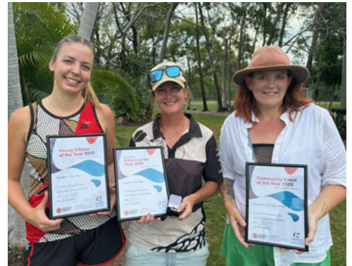
The 2025 Citizen of the Year Award recipients.