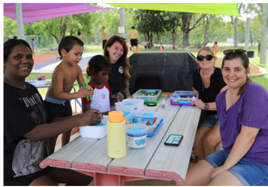
The Jabiru Childcare Zone.