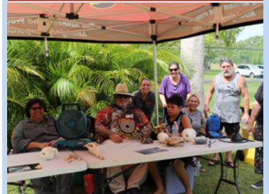
The Jabiru community enjoyed a cheerful gathering on Saturday, 1 February 2025, at the Jabiru pool.