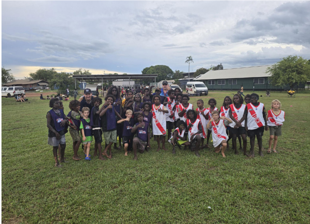
There were lots of exciting activities and games, including football, for community members to enjoy at the Gunbalanya Community Day event.