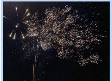
Maningrida Community is gearing up for the annual New Year's Eve Fireworks spectacular!