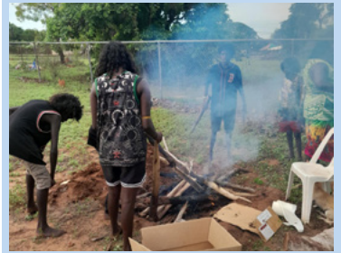
Minjilang Sport and Recreation Team host a hands-on cooking session with youth participants.