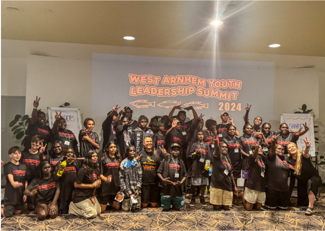
Students from Gunbalanya, Jabiru, Maningrida, and Warruwi came together in November for the 2024 West Arnhem Youth Leadership Summit.