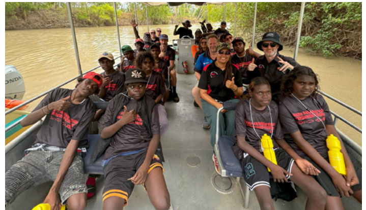
Youth Summit attendees were treated to a Gulyambi cruise thanks to Kakadu Cultural Tours support.

This project is a testament to collaboration, made possible with funding from National Indigenous Australians Agency (NIAA) and the co-design of the West Arnhem Regional Council, Youth Engagement Project, and the NT Department of Education. Additional in-kind support was provided by the ERA Community Partnership Fund, with contributions from NORFORCE, Icon Sports Northern Territory, Kakadu Air, Gunbalanya Air, Kakadu Cultural Tours and Team Health. VAMP TV joined the program, featuring the West Arnhem Youth Leadership Summit on Episode 182. Thank you to everyone who supported this initiative, attended the presentations in Jabiru and in community and most importantly, to the young leaders who remind us of the power of youth voice in shaping the future.