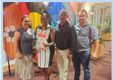
The 2024 First Circles Leadership Program has concluded with a graduation ceremony.