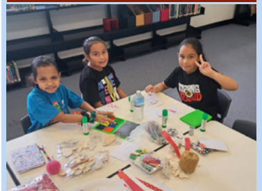
The Jabiru Community School Holiday Program is off and running with a great turn out so far.