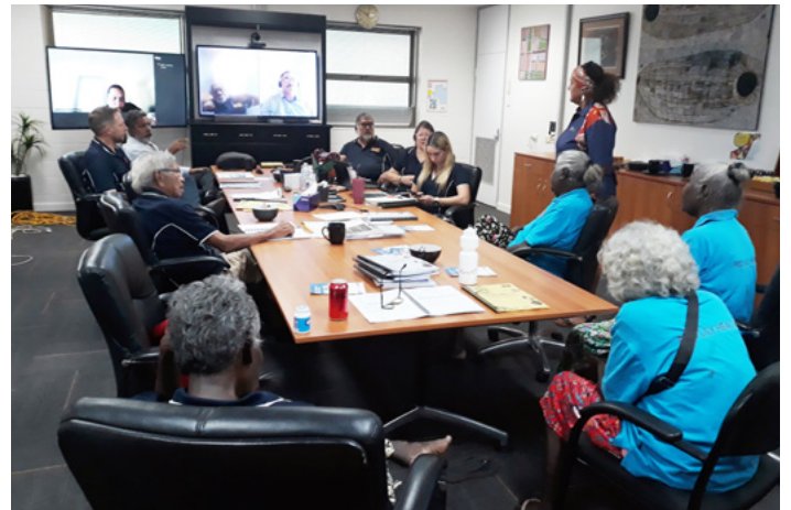
(above) Red Lily Health Board members meeting with WARC Elected Members at the Ordinary Council Meeting.

The West Arnhem Regional Council (WARC) held an Ordinary Council Meeting on Tuesday, 19 November, hearing a range of reports from various departments and hosting several key presentations.