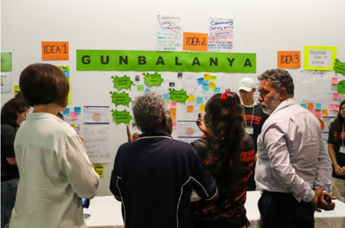
WARC Elected Members speaking with students at the West Arnhem Youth Leadership Summit.