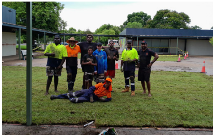
Clontarf, WARC and the team from Kakadu Native Plants supporting the Jabiru Town Square Revitalisation project.

The Jabiru Town Square Revitalisation project is well underway, bringing a fresh look and vibrant energy to the heart of Jabiru. Initiated by the Jabiru Property Services in early 2024, this community-focused effort aims to transform the town square into an inviting space for both residents and tourists. The project has been a collaborative effort, with coordination led by Jabiru Property Services, Rio Tinto, and the Department of the Chief Minister and Cabinet. As the license holder for maintaining the area, the West Arnhem Regional Council (WARC) has played a significant role, contributing manpower and resources. One of the early steps in the revitalisation was the removal of three garden beds to create open areas that will soon be with new turf. WARC's efforts to prepare the space were funded through an Activate NT grant, which enabled the purchase of soft furnishings, umbrellas, chairs, and mats. These additions will transform