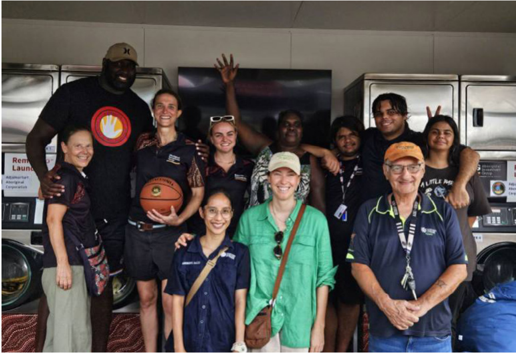
The Aboriginal Investment Group and Adjumarllarl Aboriginal Cooperation host inaugural 24-hour Wash-A-Thon at the new Gunbalanya Remote Laundry.