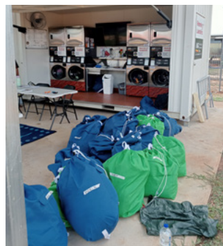
More photos, Page 2 >>