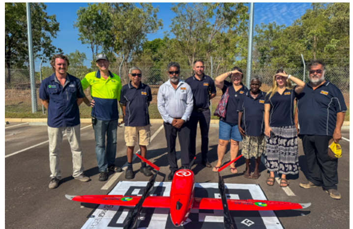
WARC Elected Members and staff with Charles Darwin University who conducted a demonstration of the new Bibi planes being trialled.

All Council meetings are open to the public, with dates and agendas available on the West Arnhem Regional Council website.