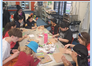
Young people in Jabiru were treated to a Halloween Festival on Thursday 31 October 2024.