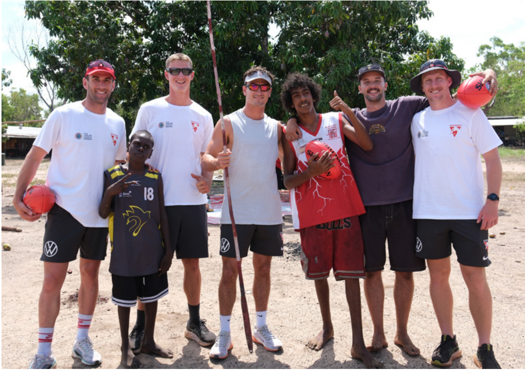
The Sydney Swans have visited the West Arnhem region to hold a successful 'Kick The Habit' Footy Festival in Maningrida. Read more below.