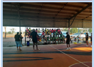
Council's Youth, Sport and Recreation hold Warddeken Youth Basketball Competition.