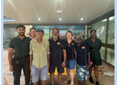
West Arnhem Regional Council's Elected Members participated in a valuable training session