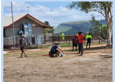
Gunbalanya can look forward to a new and improved sports oval shortly with contractors currently onsite.