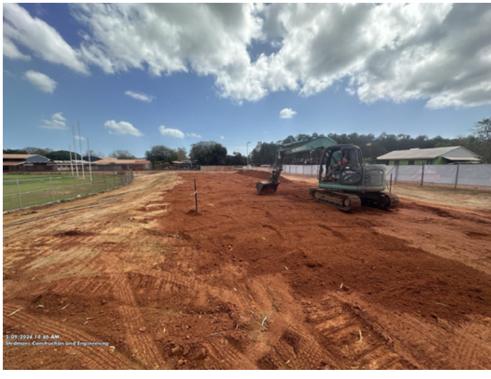
The Maningrida Oval grandstands and changerooms are significant projects which will bring huge benefits to the Community.