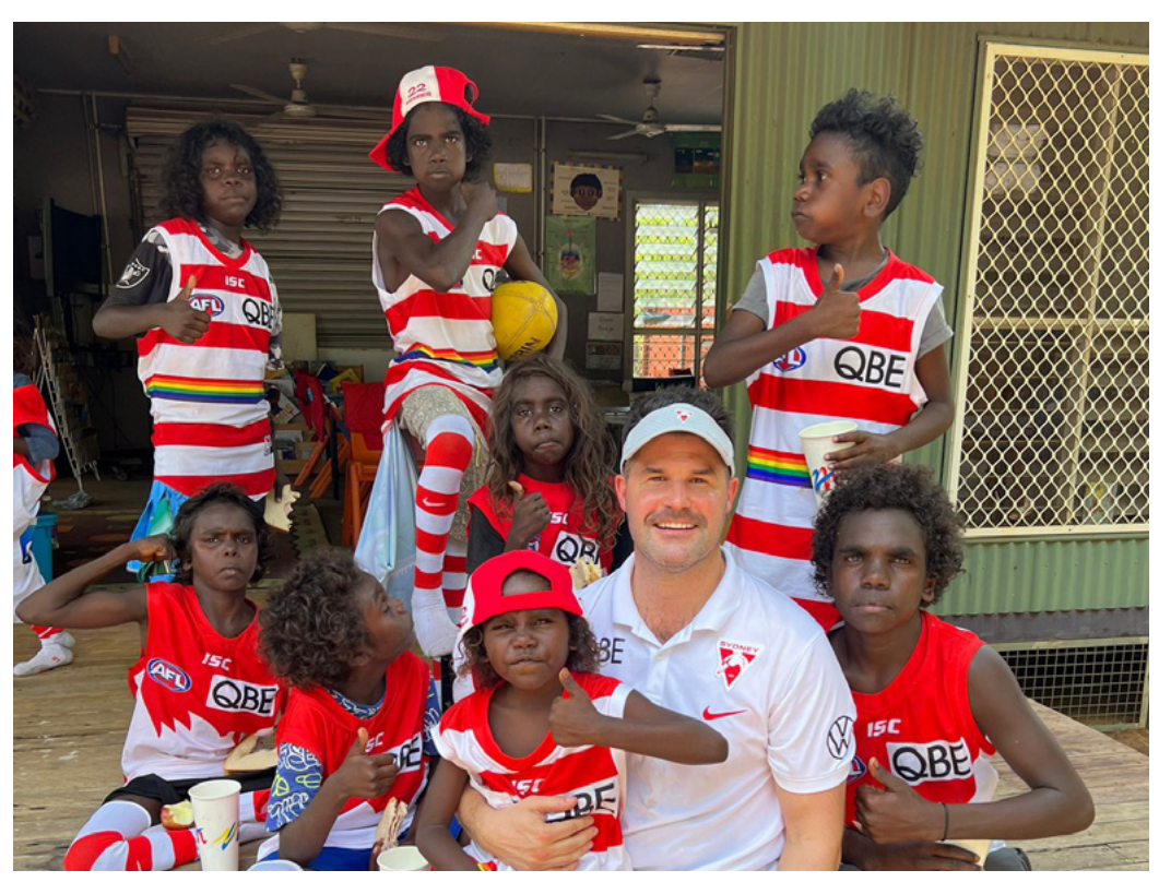
Pictured is the last Sydney Swans visit to Maningrida. The team will be returning to Maningrida to host the Maningrida Footy Festival on November 15 - 17.

wire@westarnhem.nt.gov.au 08 8979 9465 Published by West Arnhem Regional Council