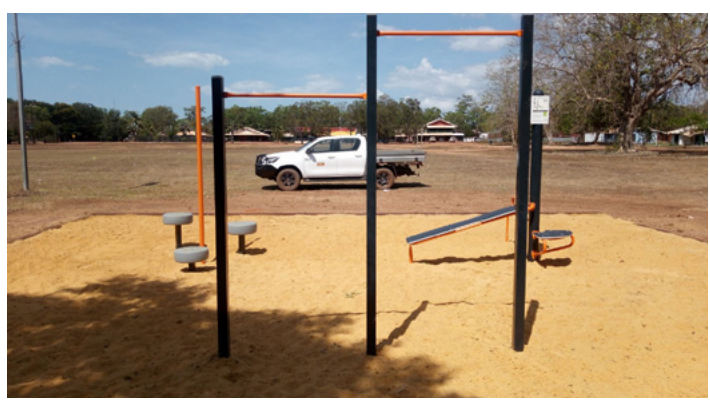
The Maningrida Community can enjoy the new outdoor gym equipment.