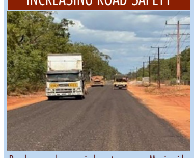
Road upgrades carried out across Maningrida, Warruwi, and Gunbalanya this dry season.