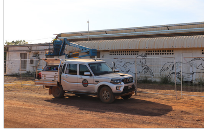
Warruwi Community Hall reroof is underway.

With these projects in motion, WARC continues its commitment to enhancing Community infrastructure and services to build stronger Communities.