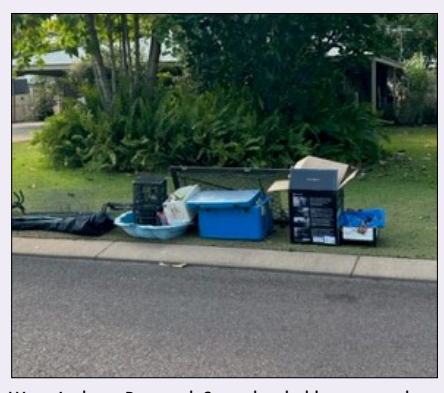
West Arnhem Regional Council is holding pre-cyclone clean ups across all West Arnhem Communities. See dates below.