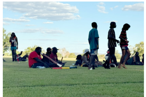
Thank you to the Garrak Bombers team from Katherine who performed cultural dancing after the ceremony.