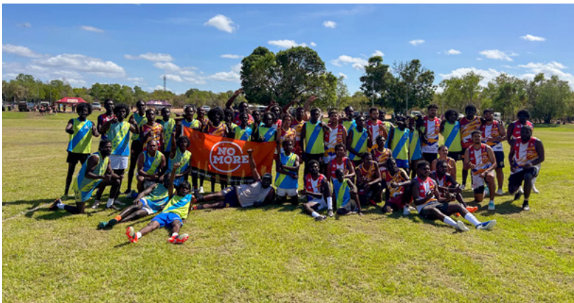
Minjilang and Waruwi joining up to take on Gunbalanya at Kurrung in the Men's AFL competition.