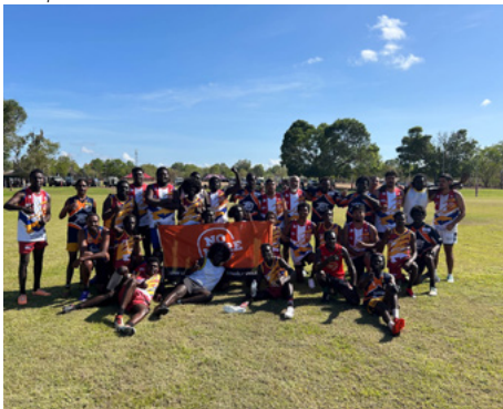
Community spirit shone through as players from different Communities joined up to form an 'islands' team in the men's AFL.