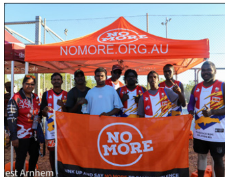
The Warruwi men's basketball team looking great in their new uniforms.