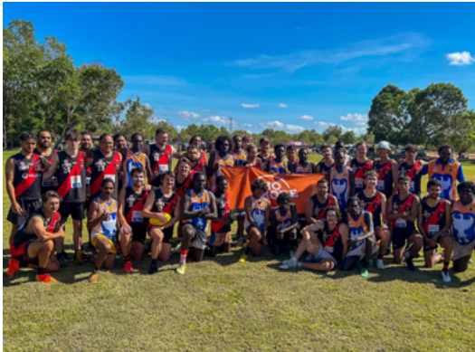
The Maningrida and Jabiru men's AFL teams showing great sportsmanship before their game in the competition.