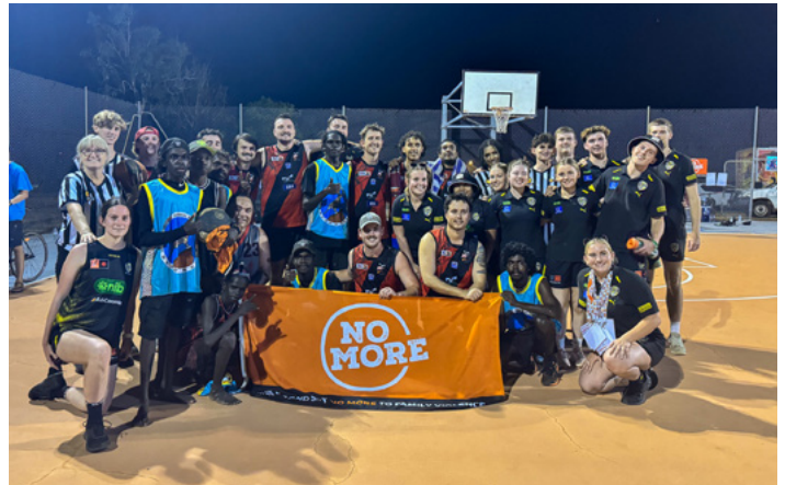
The Gunbalanya and Jabiru men's basketball teams show great sportsmanship at the end of the grand final game, they are pictured with the referees and Richmond Institute.

Northern Territory Government, ERA, NIAA, Red Lily Health, Adjumarllarl Aboriginal Corporation, Stedman's Constructions, Mala'a Health, Gunbalanya Sports and Social Club, No More campaign, TEABBA, Team Health, AMSANT, AFL NT, Basketball NT, Kakadu Lodge, Richmond Institute, Cooina, Sodexo, Blueridge Engineering, Jabiru Service Station, OzHarvest, ALPA, Kakadu National Park, Caulfield Grammar, Jabiru Area School.