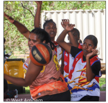
The Maningrida and Warruwi women's basketball teams on court battling it out to be in the grand finals.