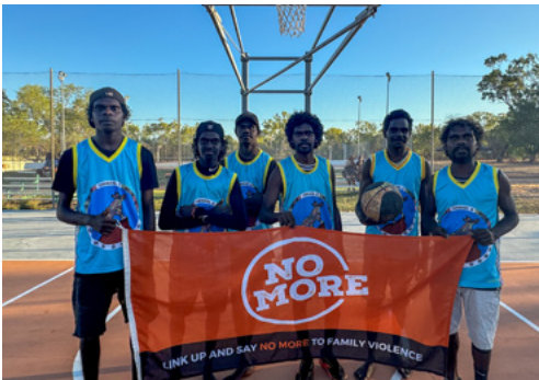
Congratulations to the men's basketball competition runners up from Gunbalanya.