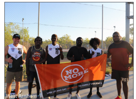
The Minjilang men's basketball team getting ready to take to the court on the Friday night.