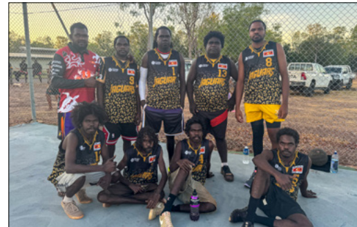
Maningrida's men's basketball team showing off their new team uniforms before the competition got underway on Friday night.