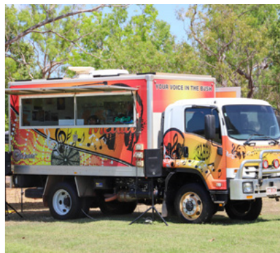
Thank you to TEABBA Radio for partnering with the sports carnival to provide a live broadcast from the event all weekend.