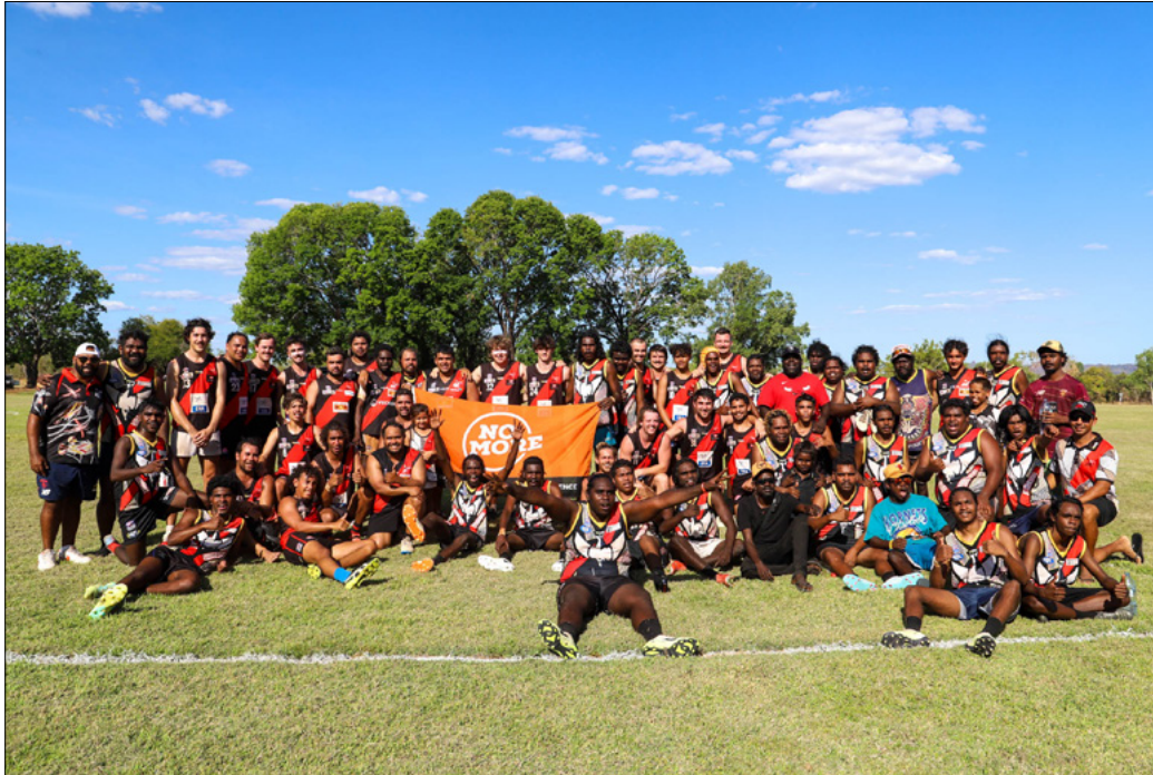
Kurrung Sports Carnival, hosted by West Arnhem Regional Council, brought together men's and women's sports teams from Jabiru, Minjilang, Maningrida, Warruwi, Gunbalanya and Katherine on 30 & 31 August 2024.