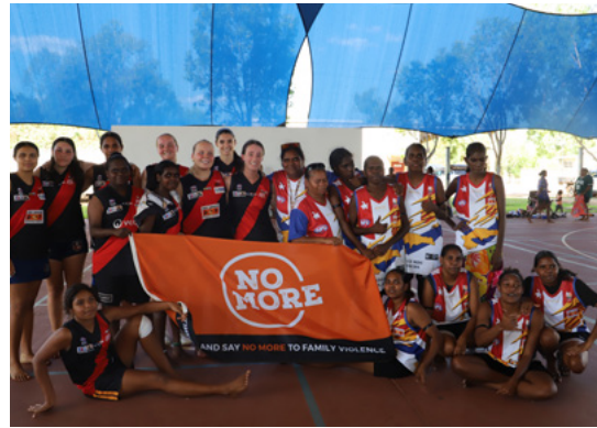
Warruwi and Jabiru women's basketball teams come together in unity after Warruwi took the win in the grand final.