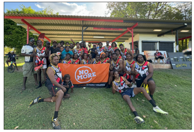
The Garrak Bombers team celebrating being awarded the 'Spirit of Kurrung' cup for displaying the values of the carnival.