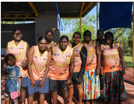
The Maningrida women's basketball team coming together for a photo before the competition got under way.