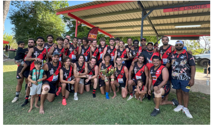
The men's AFL winners the Jabiru Bombers celebrating their win on home soil in the grand final against Garrak Bombers from Katherine.

'Spirit of Kurrung' Cup: Garrak Bombers, Katherine