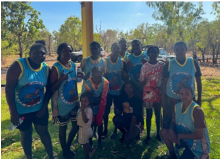
The Gunbalanya women's basketball team just missed out on being the grand final. They displayed great talent.