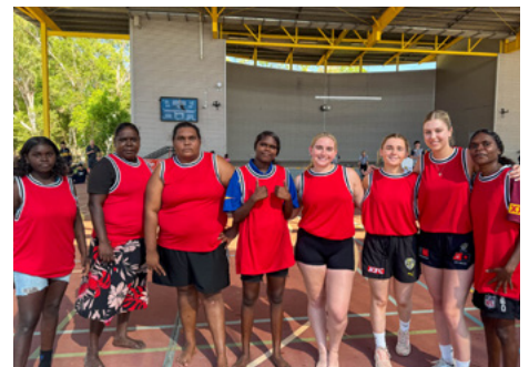
The Minjilang women's basketball team supported by Richmond Institute did well in the competition.