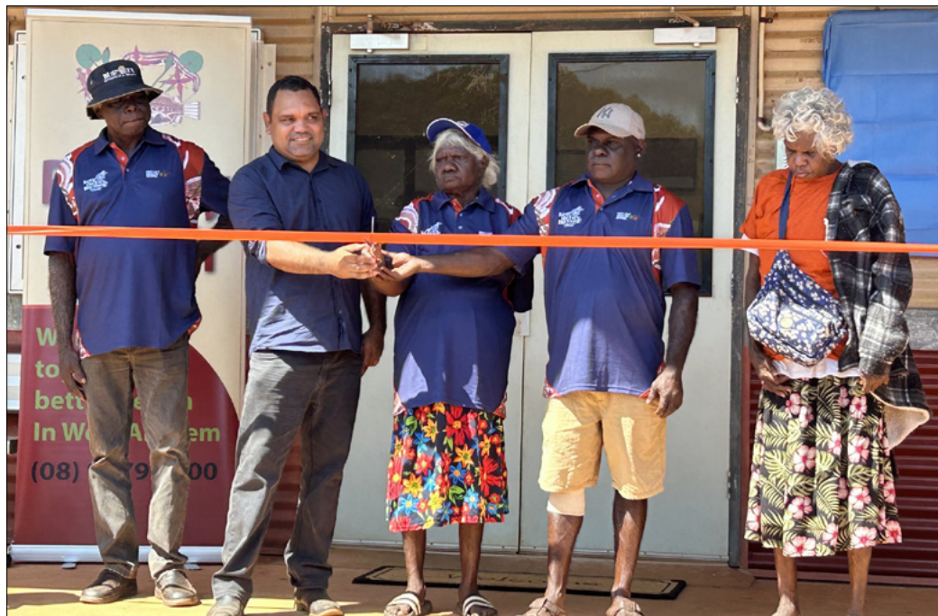
The official opening of the Warruwi Community Health Centre was held on Thursday, 25 July 2024 with Community members, officials and stakeholders celebrating the occasion.