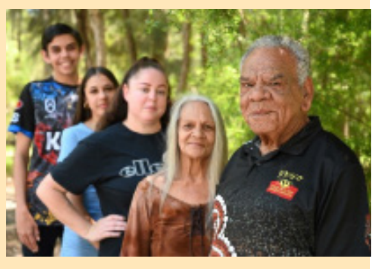
24/7 from any mobile or pay phone Aboriginal & Torres Strait Islander Crisis Supporters to yarn to.

- Free and confidential service available