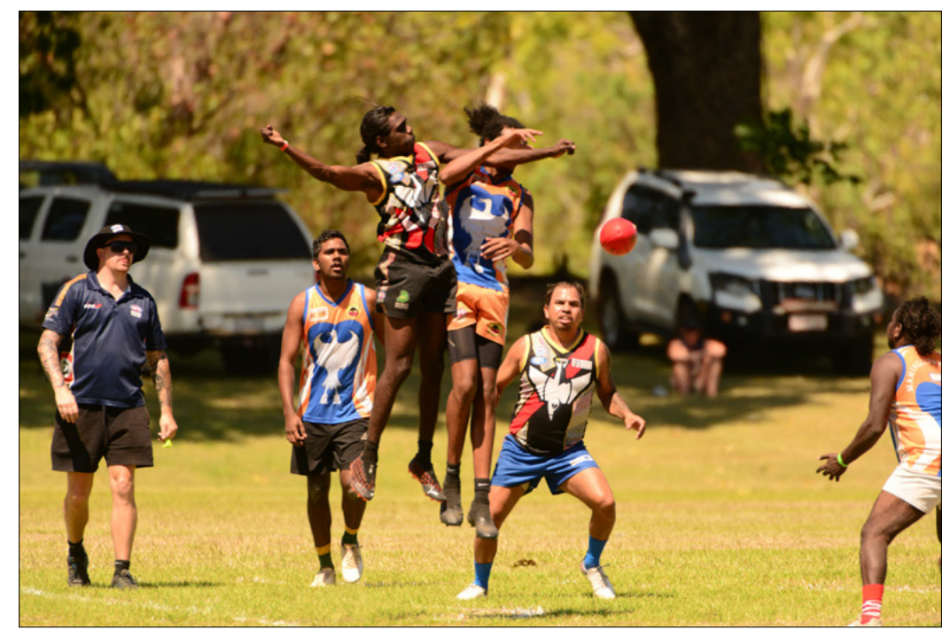
Sports teams across the region are gearing up for the highly anticipated 2024 Kurrung Sports Carnival which will be held in Jabiru on 30 and 31 August 2024.

wire@westarnhem.nt.gov.au 08 8979 9465 Published by West Arnhem Regional Council