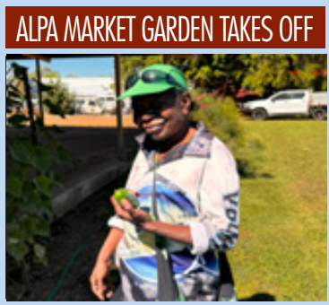
Jabiru ALPA Office market garden continues to grow, providing produce for local families.