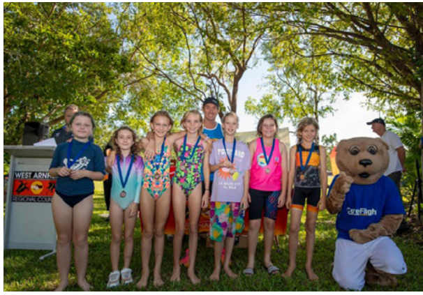
Well done to all of the young people who participated in the junior triathlon.