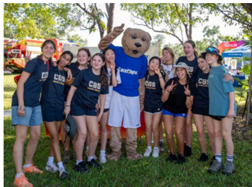
Well done to all Caulfield Grammar students who volunteered and participated in the 2024 Kakadu Triathlon.