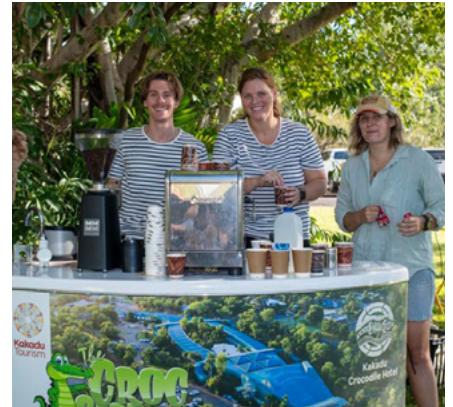
Thanks to the Crocodile Hotel for bringing the croc cart.