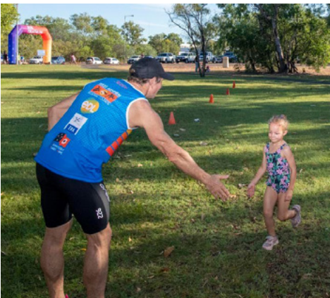
The Junior Triathlon has around 30 young participants on the course.