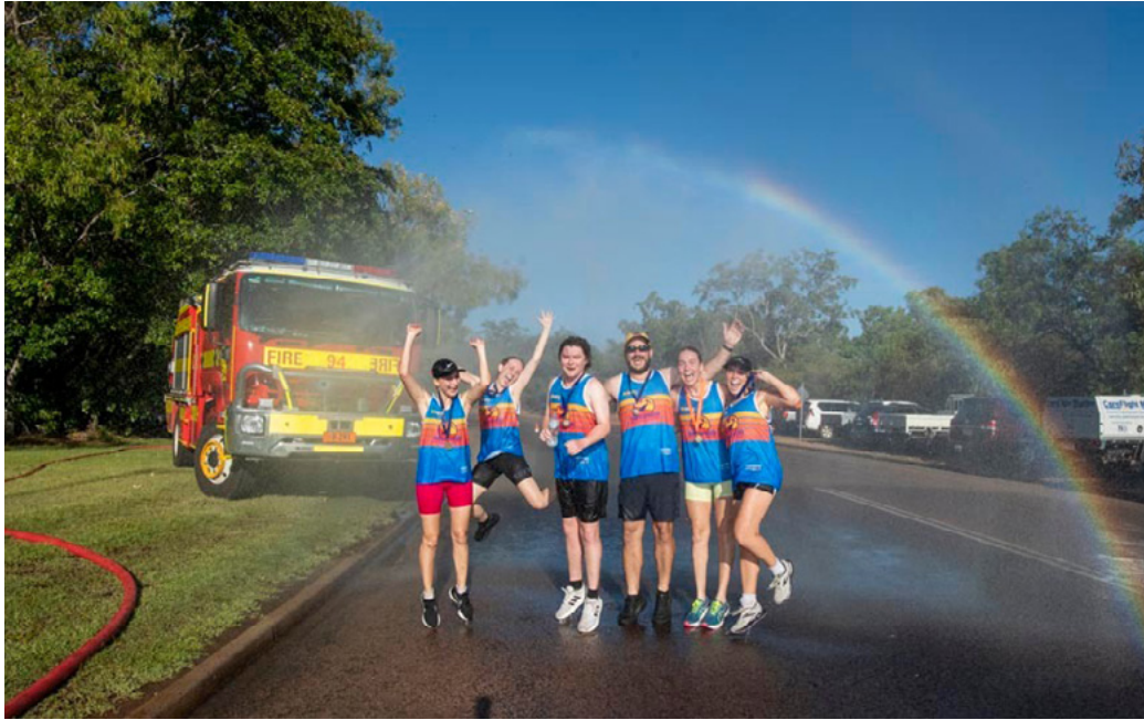
2024 Kakadu Triathlon participants celebrating at the finish line.