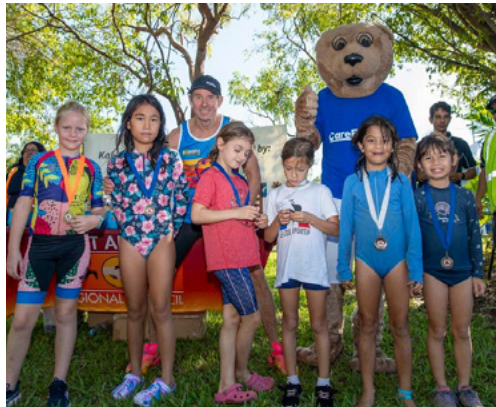
The young people who participated in the junior triathlon receiving their medallions.