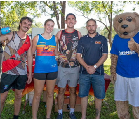
Winners of the Open Triathlon Team event.