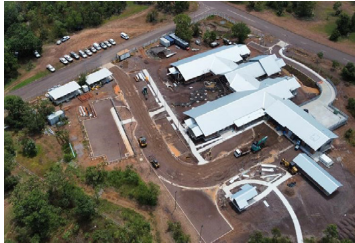
Aerial of the Jabiru Health Centre progress.

The facility includes eight consulting suites with dedicated male, female and paediatric rooms, four multi-purpose allied health examination rooms, a four-