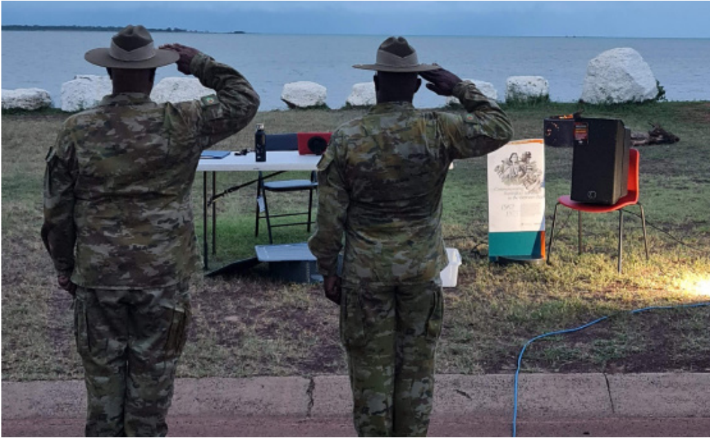
West Arnhem Communities will commemorate Anzac Day on Thursday, 25 April. Read all 2024 service details on Page 5. Pictured is the 2023 dawn service in Warruwi.